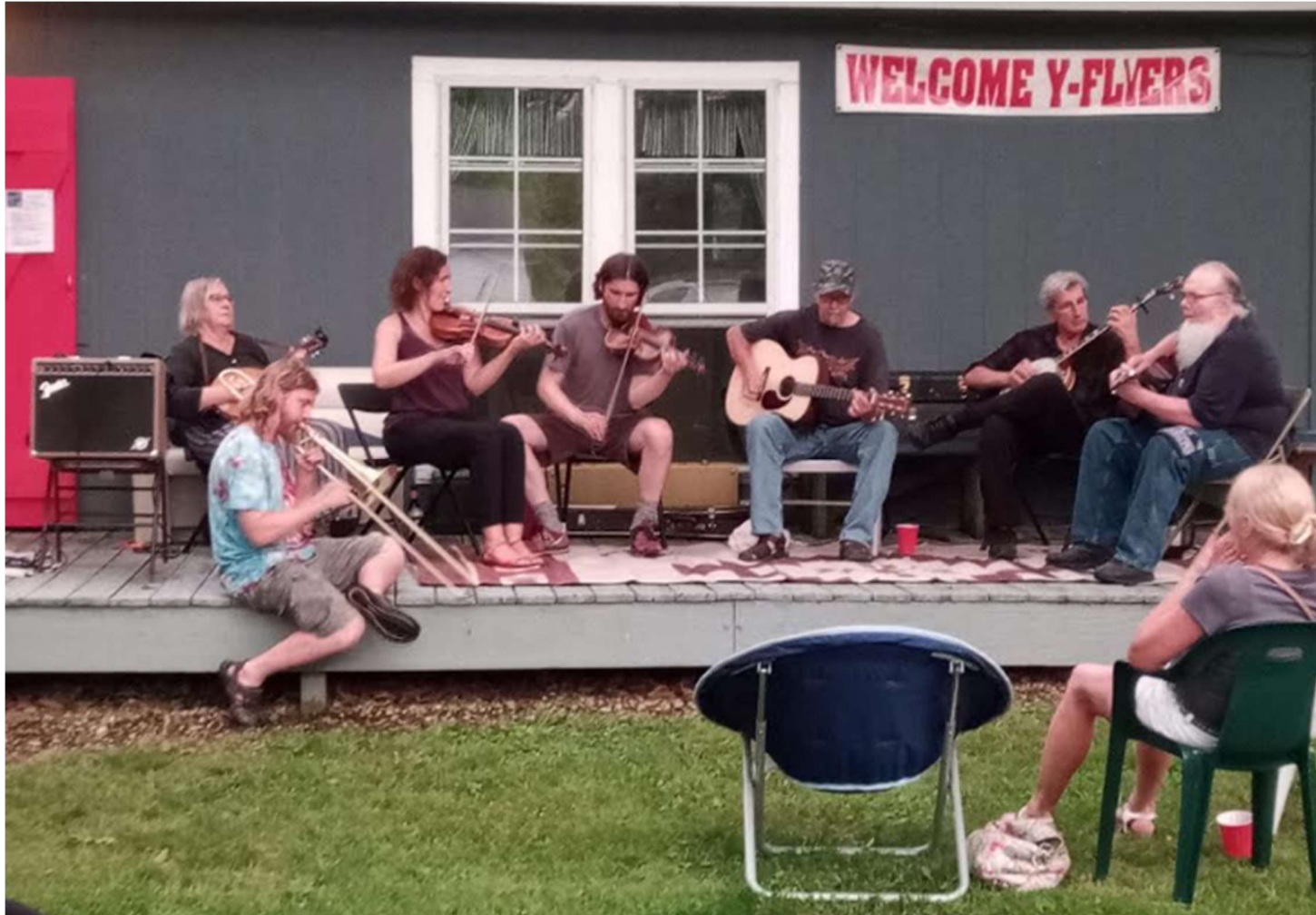
Pickin' and Playin'