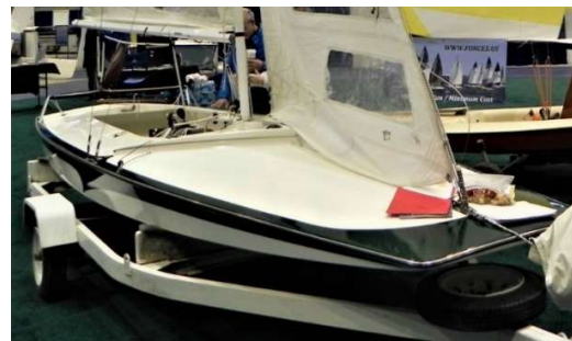
(pictures taken of Y-2804 at the Chicago Boat Show at the Y-Flyer display)