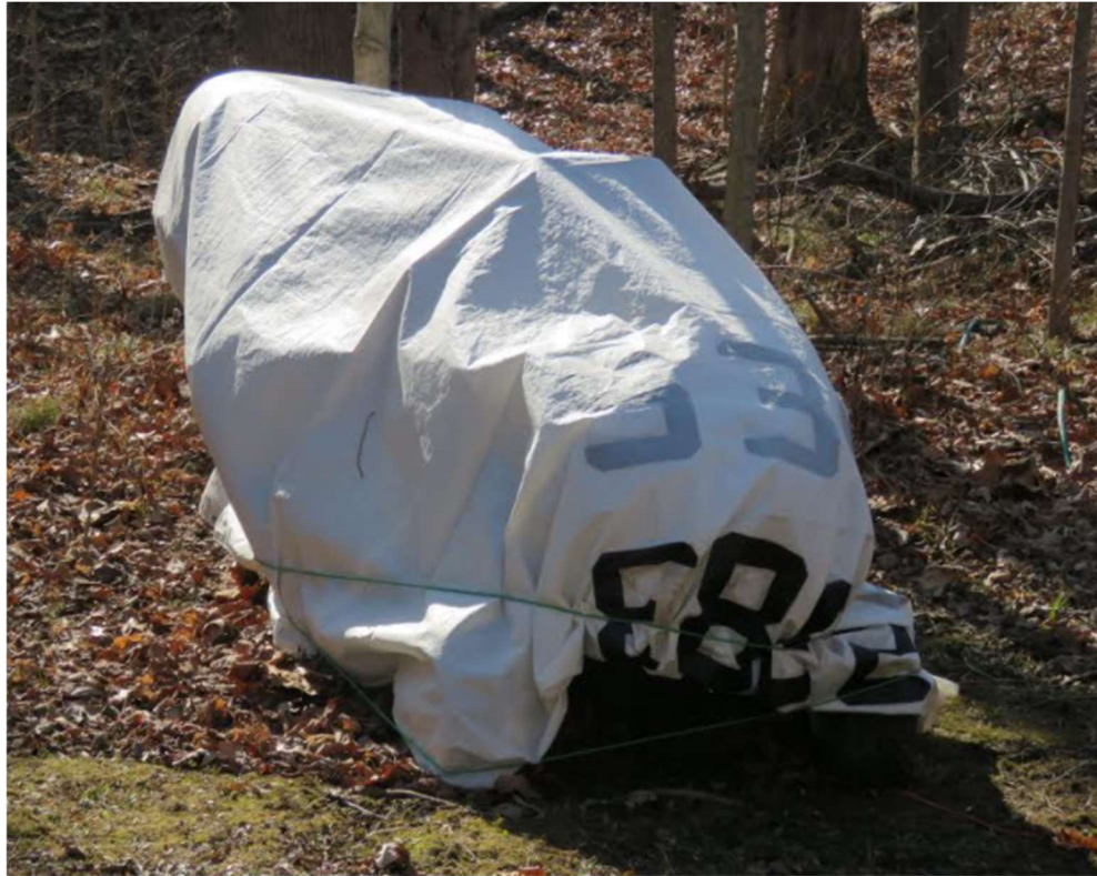
A winter cover for your lawn tractor.....??