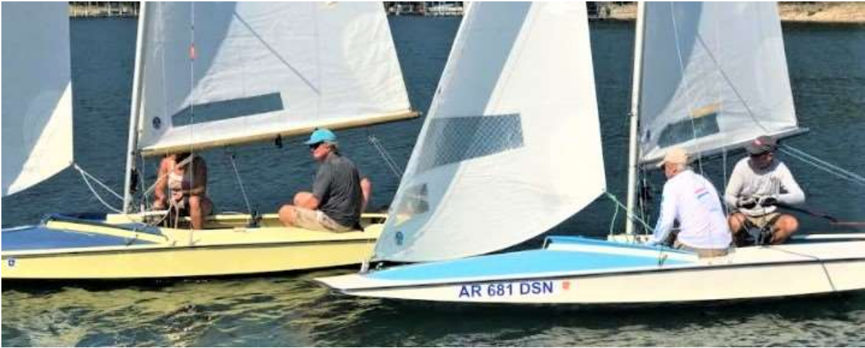
Fleet members matching and tuning boats