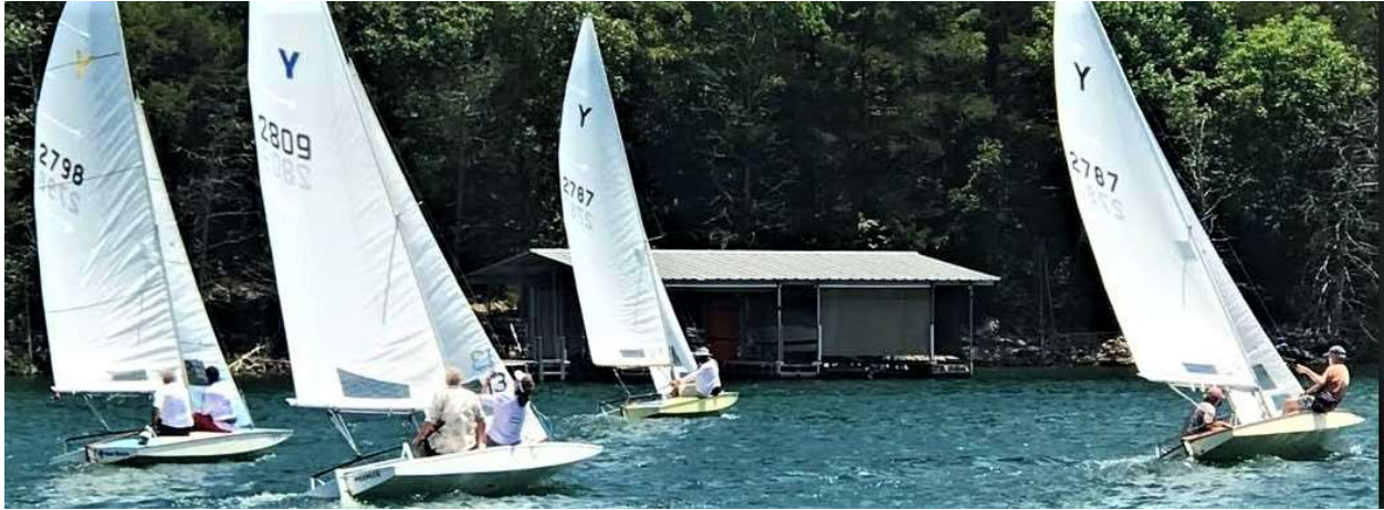
The fleet sailing to windward