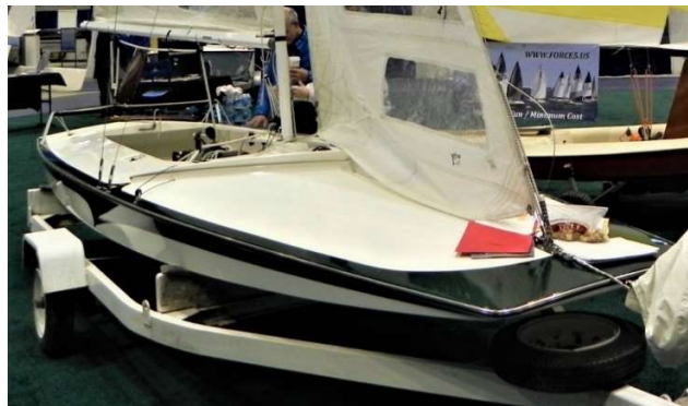
(pictures taken of Y-2804 at the Chicago Boat Show at the Y-Flyer display)