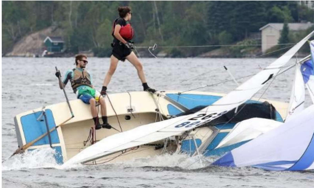
....After crossing the finish line at Sudbury with trapeze and spinnaker...showing off for the camera!