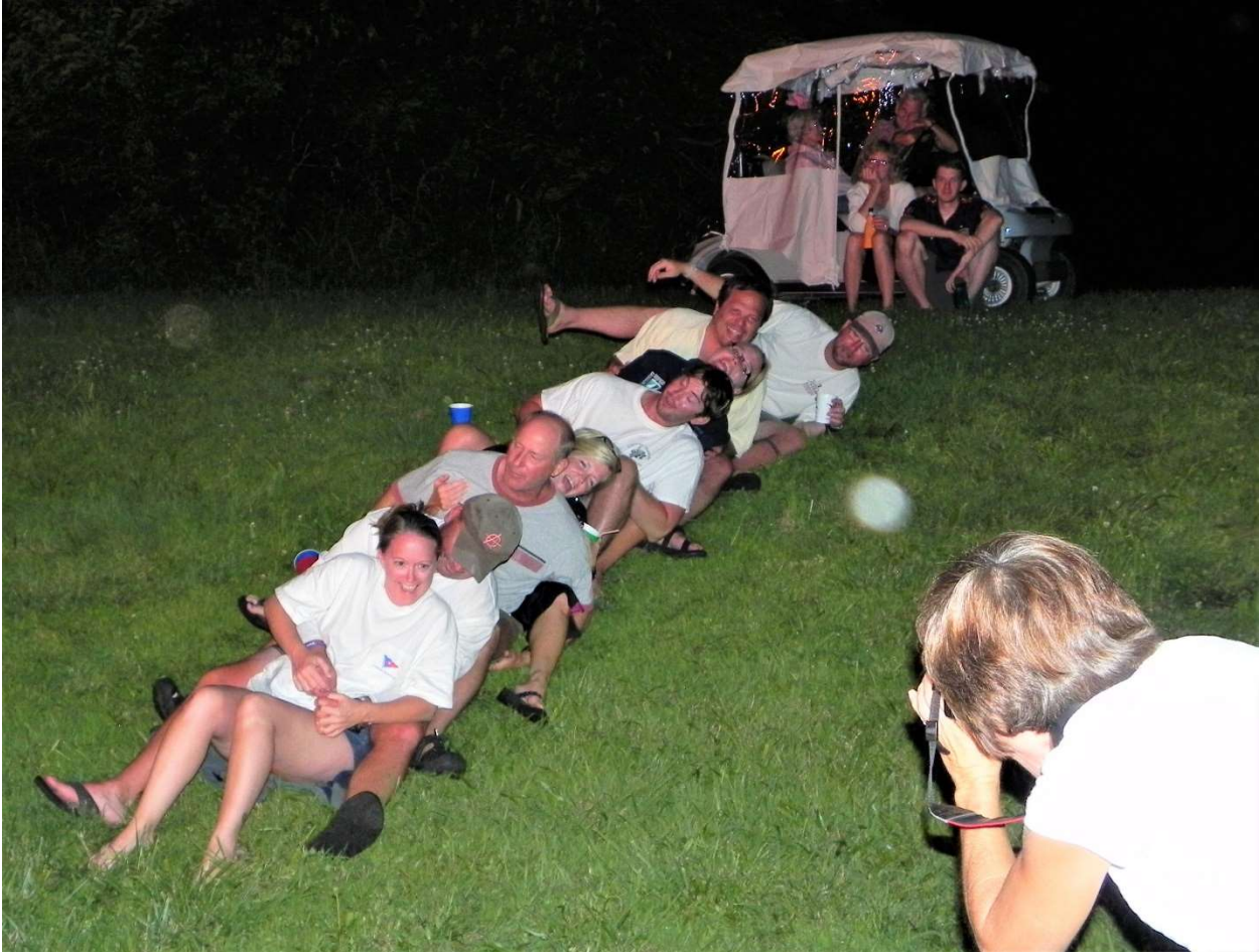
Here's a classic picture from the 2011 Riviera Regatta. The American Y-Flyer Bobsled Team practicing for the Winter Olympics. The Jamaican Bobsled Team was worried no doubt!