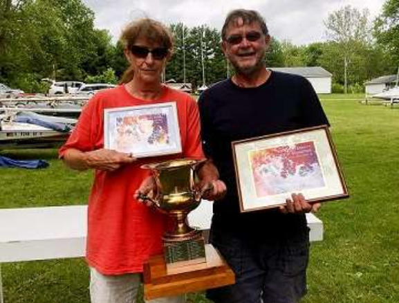
The Current Reigning Riviera Champions from 2019: