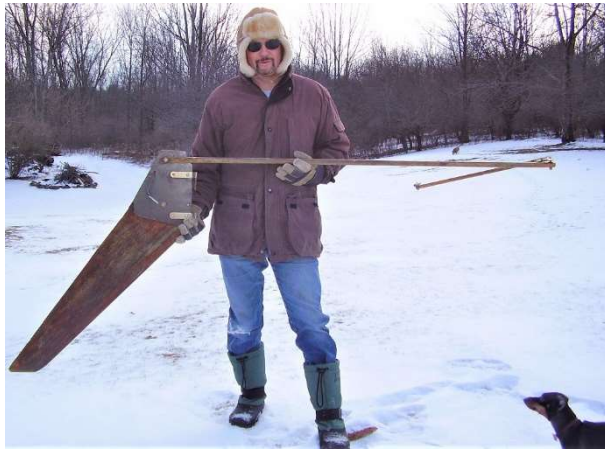
But first.....Your editor holding a Helms designed Long Island Rudder called a "weed slipper."

Editor comments: The photos that follow are an actual parts list for Y-Flyers and a signed bill of sale for one of the 12 boats ordered from Helms in 1970 by members of the Westhampton Yacht Squadron. The club raced on the south shore of Long Island in the shallow waters of Moriches Bay. They raced the Y's with spinnakers and a special tapered rudder called a "weed slipper." You might notice the "Long Island rudder" for $45.