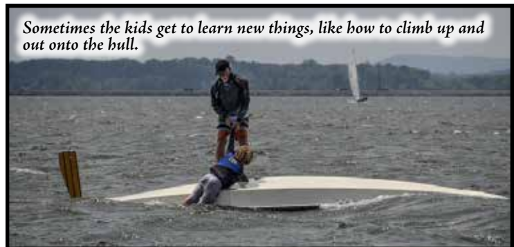
Sometimes the kids get to learn new things, like how to climb up and out onto the hull.