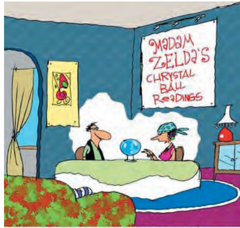
"I see your wife is going to kill you when she learns you bought another boat. But, you didn't need me to tell you that."

Instructions Combine flour, baking soda, baking powder and salt in a bowl. Use a mixer to blend together the eggs, sugar, butter, vanilla, lemon extract and lemon juice in a medium bowl. Pour wet ingredient into the dry ingredients and blend until smooth. Add oil and mix well. Pour batter into a well greased 9x5-inch loaf pan. Bake at 350 degrees for 45 minutes or until a toothpick stuck into center of the cake comes out clean. Make the lemon icing by combining all the icing ingredients in a small bowl with an electric mixer on low speed. When the loaf is cool, remove it from pan and frost the top with the icing. Let the icing set up before slicing.