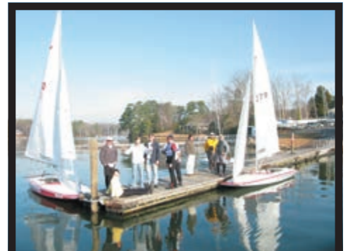
Dock talk. Tall masts and tall tales.