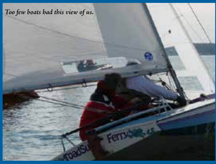
Too few boats had this view of us.