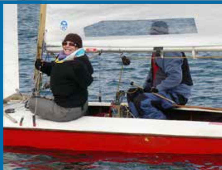
Winning MidWinters requires a happy crew, no matter what the weather!