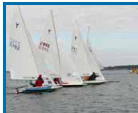
MidWinters chill in coats