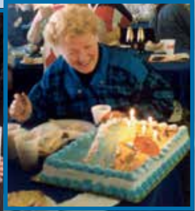
"I remember a big celebration one year at Midwinters! Seems that I recall that the wrong boat was decorated for Doug, too!"