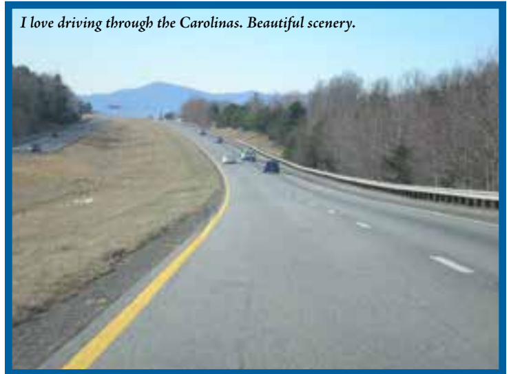
I love driving through the Carolinas. Beautiful scenery.

Before that, however? On to the next regatta!