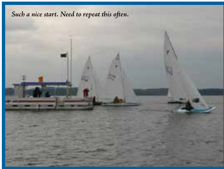
Such a nice start. Need to repeat this often.

Race 2 was our best effort. I pulled a slick move at the start. We had gybed down at the pin and were heading along the line on port with about 1 minute to go. We were hole-hunting, but a hole never appeared until we were almost to the committee boat. CSC's committee boat has a "keep away" bumper on the back of the boat, thus creating a larger empty "triangle" of space between the committee boat and the starting line. Nile was counting down and when we got to about 7 seconds, I decided to go for the port tack start at the boat. I could always tack if needed. Not needed. At the gun, we were going full speed. I didn't want to start there, but when forced, you need to be moving, and we were.