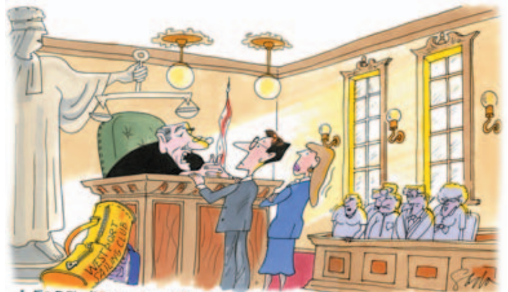
I FOREWARN YOU COUNSELLORS, JUSTICE WILL BE DISPENSED SWIFTLY TODAY, IT'S REGATTA WEEKEND YOU KNOW.