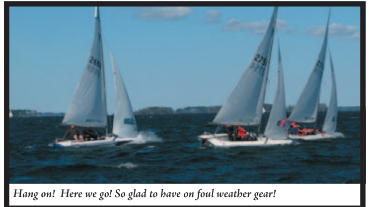
Hang on! Here we go! So glad to have on foul weather gear!