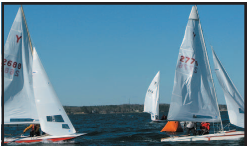
Can you bear the sails?

Hope to see everyone along the regatta path this year.