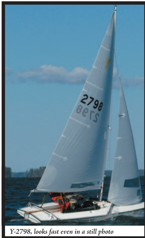
Y-2798, looks fast even in a still photo