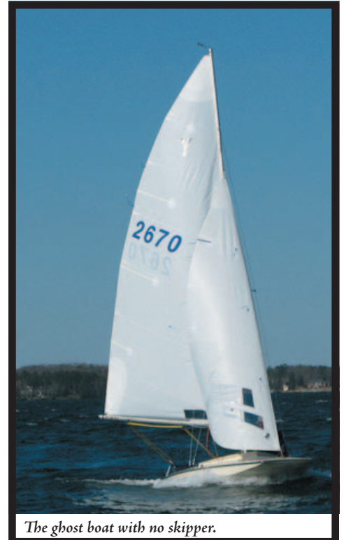
The ghost boat with no skipper.